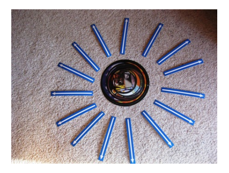
Figure 4. "Our Planet, Our Home" (Gang & Morgan, 1988): All elements of the Universe are shown united as one single point about to rush apart. This arrangement was created by the participants in the group activity completed in Santa Barbara, CA, November, 2013.

The seven lessons of chaos may create a new and valuable paradigm for understanding humankind's place in the Universe. Understanding chaos requires a return to the beginning of time, the origin of everything. Confronted with that creative vortex of energy, one might see how all is connected, that out of one tiny dot, smaller than a grain of sand, everything unfolded. "All of space and time and mass and energy began as a single point that was trillions of degrees hot and that instantly rushed apart" (Swimme & Tucker, 2011, pp. 5-6).