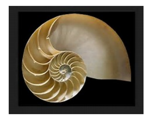
Figure 2. Chambered nautilus.

"Fractal" is the name given by scientists to the patterns of chaos that we see in the heavens, feel on earth, and find in the very veins and nerves of our bodies. The word was coined by the mathematician Benoit Mandelbrot and now has wide use in chaos theory, where fractals refer to the tracks, marks and forms made by the action of chaotic dynamical systems. (Briggs & Peat, 1999, p. 100)