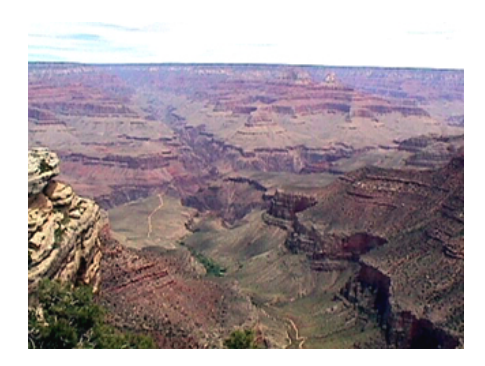
Figure 1. Grand Canyon.

Fractals are patterns that emerge out of chaos. It is possible to see them everywhere in the Universe. In fact, fractals are the epitome of the saying "As above, so below" (Briggs & Peat, 1999, p. 148). There seem to be patterns in the Cosmos that are repeated in instances both enormous and miniscule.